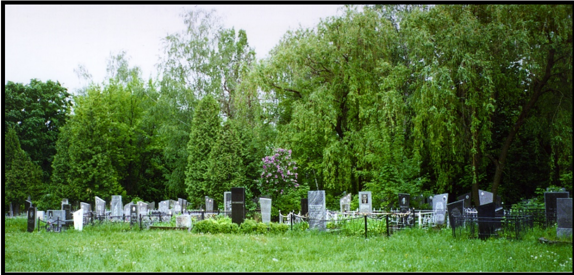
View of portion of Jewish Cemetery in Uman, 1998

These telephone books are searchable via an OCR search by clicking here . See next page for sample telephone entries.