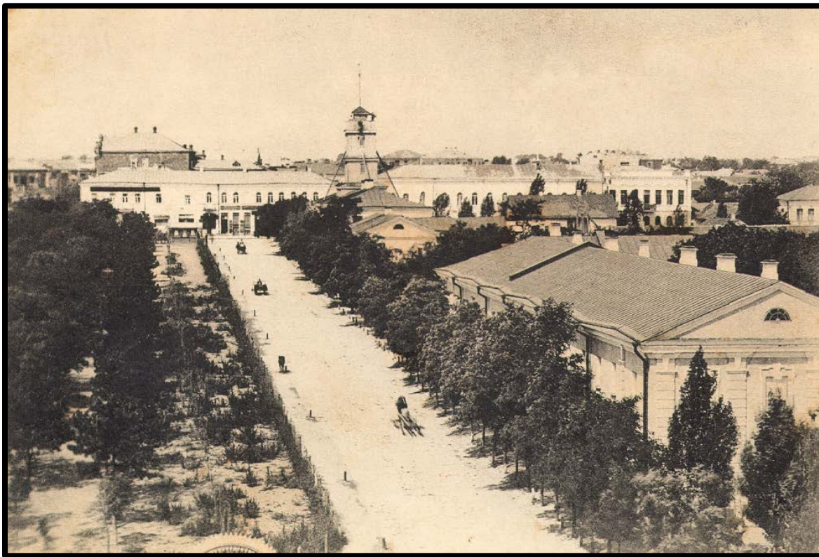
Local view of Uman, c. 1903